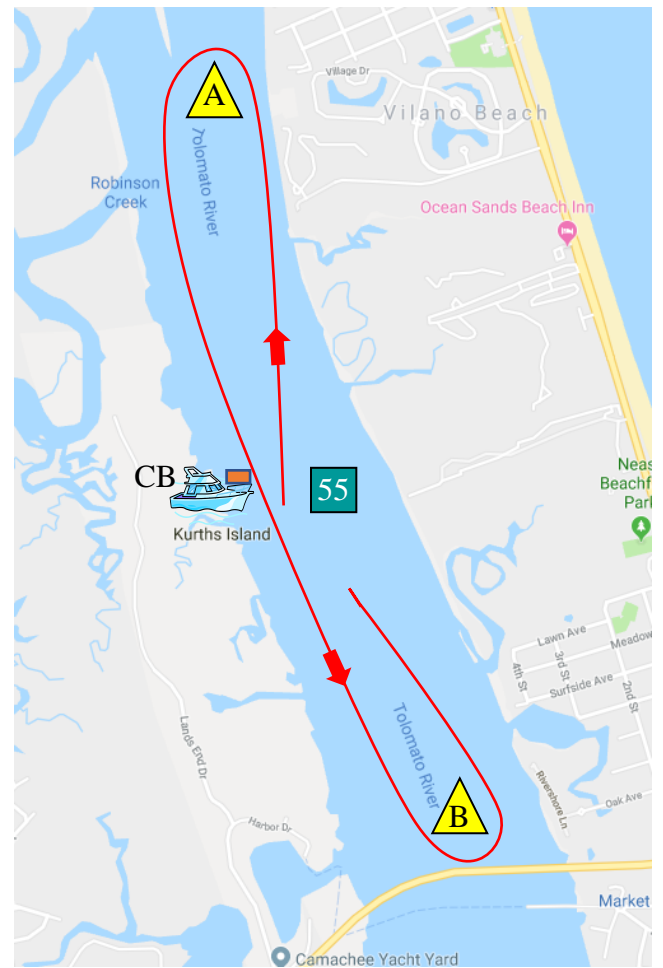
Course - South