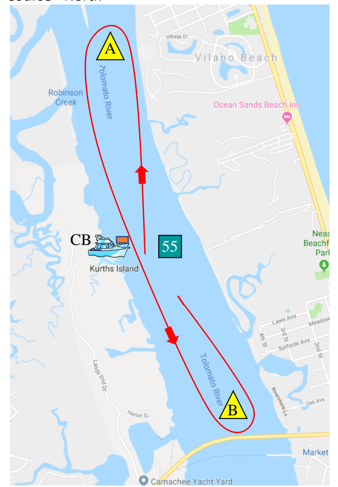
Course - South