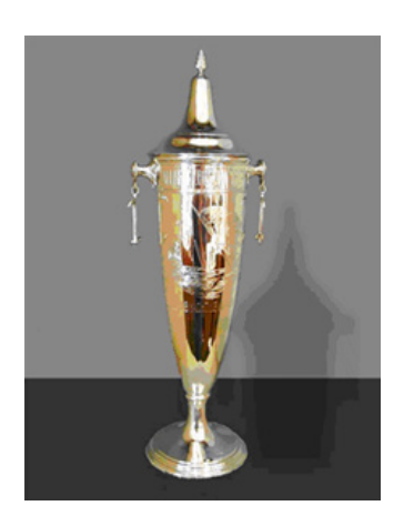
ALFRED 1. DUPONT SAILING AWARD

Winner's name placed on Fall Regatta trophy