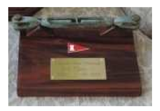
PERFORMANCE CLASS TROPHIES